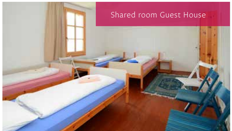
Shared room Guest House