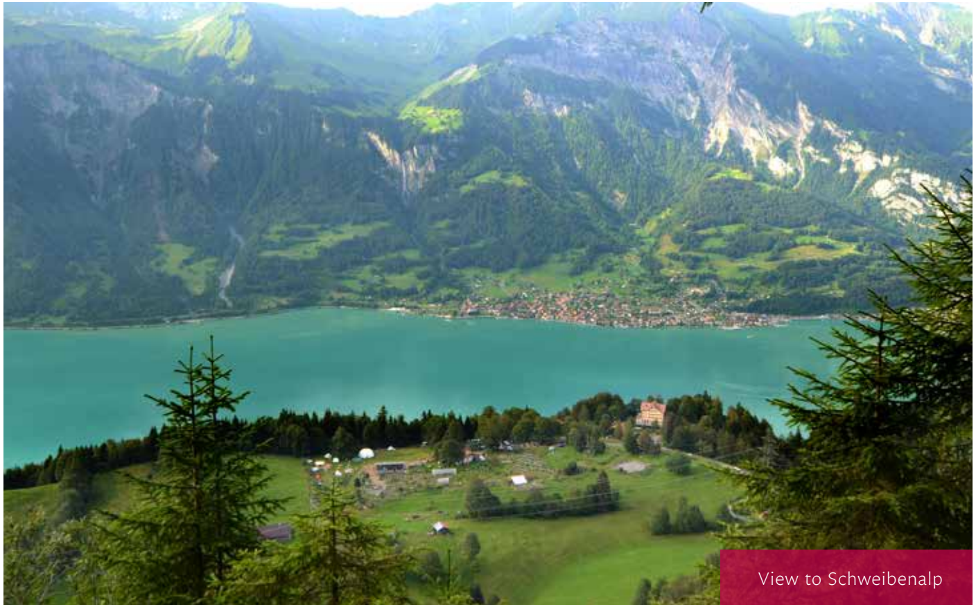
View to Schweibenalp