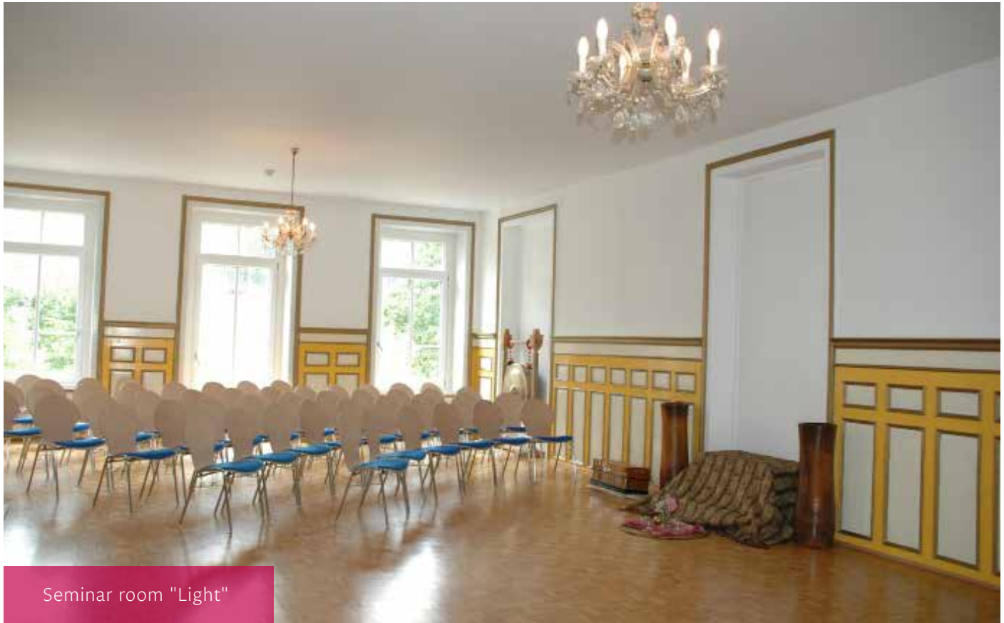
Seminar room "Light"

which is perfect for physical exercise, outdoor activities or performances in the open-air arena. Seminar room Peace is very well suited for larger events with physical activity (yoga, Qigong, dancing etc.).