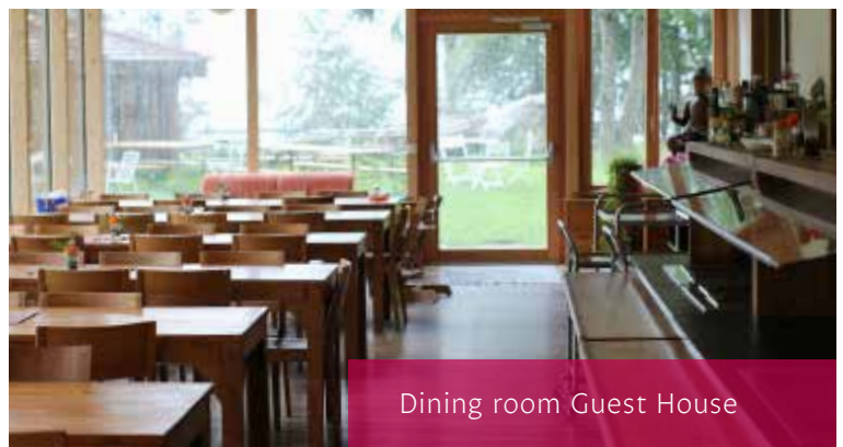
Dining room Guest House