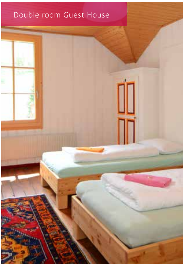
Double room Guest House