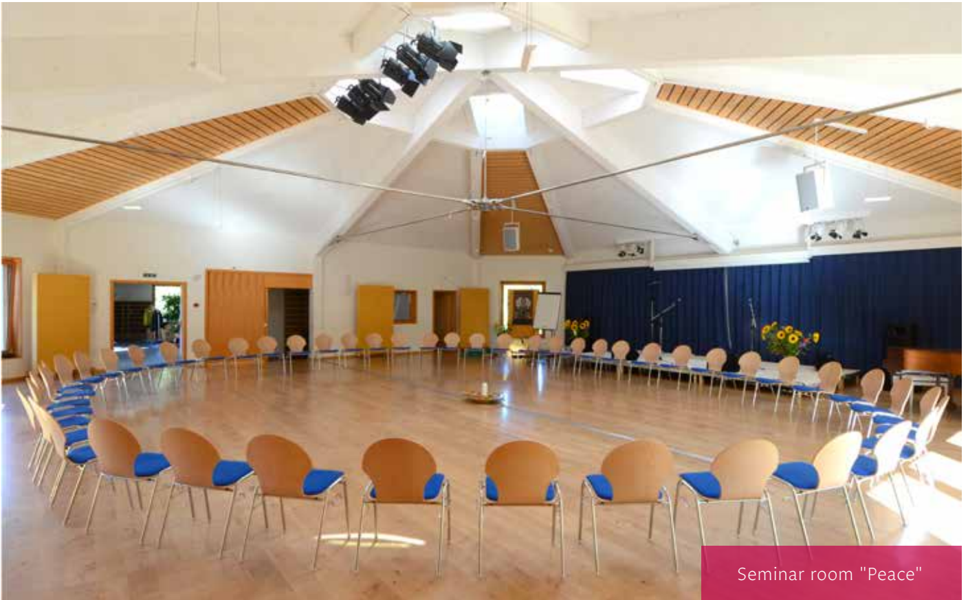
Seminar room "Peace"